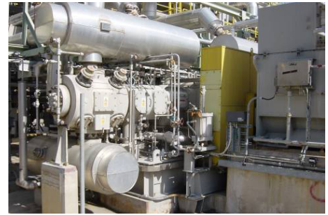
One of the three hydrogen compressors